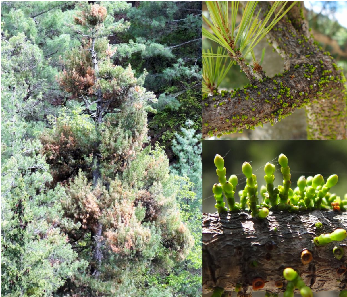
Fig. 2. Arceuthobium minutissimum Hooker: The infected Pinus wallichiana tree with dying and dried branches (left); heavy infestation on infected branch (right top) and close-up of the pistillate plant (right bottom).

and insect pests are reported to cause high pine mortality during years of average precipitation which is more frequent in the presence of other stress factors, such as drought (Schultz & Allison 1982). The annual as well as monsoon rainfall has been declined in high altitudes of Western Himalaya during last 5–6 decades and negative trends of post monsoon and winter precipitation is also evident (Singh & Mal 2014). These conditions may favour maturity and dispersal of seed of the dwarf mistletoe which is limited by the cold temperature towards the end of growth period.